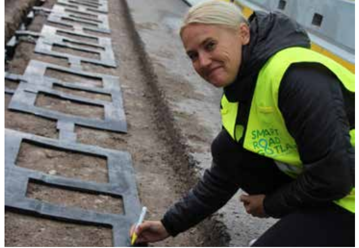
Laying road segments.