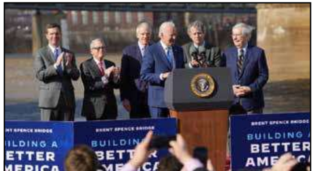
Left to right: Gov. Andy Beshear (D-Ky.), Gov. Mike DeWine (R-Ohio), recently retired Sen. Rob Portman (R-Ohio), President Joe Biden, Sen. Sherrod Brown (D-Ohio) and Senate Minority Leader Mitch McConnell (R-Ky.) at the Jan. 4 announcement of a federal grant to improve the Brent Spence Bridge.

Rebuilding the Brent Spence Bridge has been years in the making and finding new infrastructure champions will not happen overnight, either. Rest assured, in year-two of the IIJA, ARTBA remains focused on sharing transportation improvement success stories every step of the way.