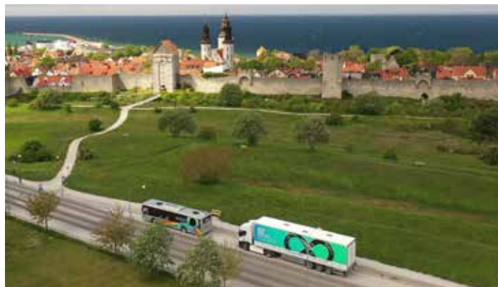
Electreon powered vehicles in Gotland, Sweden.

What Electreon envisions instead is a business model that turns existing roadways into a revenue source for state governments or other entities. With motorists paying a fee to charge their EVs as they drive, no longer is road upkeep and pothole-filling an expense with no return. Road maintenance is now a necessity borne of profit motive.