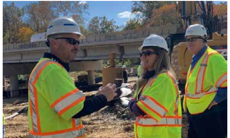
In October, Rep. Jennifer Wexton (D-Va.) met with Shirley Contracting executives on a project site in Northern Virginia.