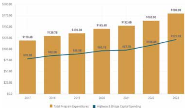
State Transportation Program/Budget Expenditures

Four out of five states expect to spend more on highway and bridge capital outlays in FY 2023, compared to the previous year.