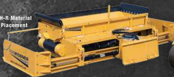
FH-R Material Placement